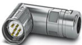
The figure shows the 6-pos. product version with solder contacts

Cable connector, CA, angled, shielded: yes, SPEEDCON locking, M23, No. of pos.: 8+1, type of contact: Pin, Crimp connection, cable diameter range: 3 mm ... 14.5 mm