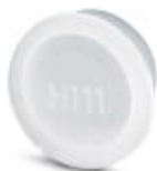
Plastic protection cap for connectors with M23 knurled nut