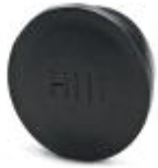
Plastic protection cap, antistatic, for connectors with M23 knurled nut

Plastic anti-static dust protection cap - RC-Z2468 - 1611796